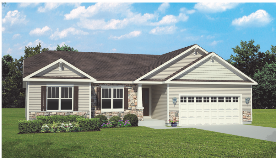
Elevation 1 with optional stone