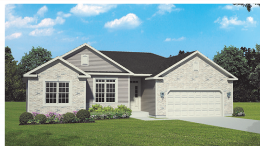
Elevation 2 with optional brick