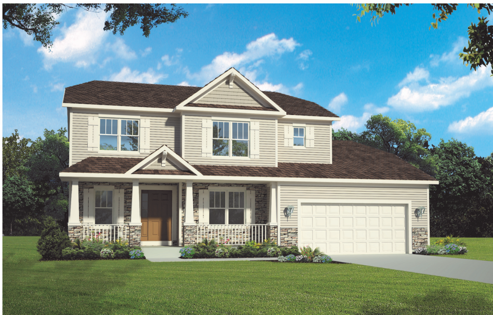
Elevation 1 with optional stone