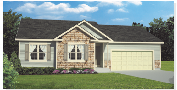
Elevation 2 with optional stone