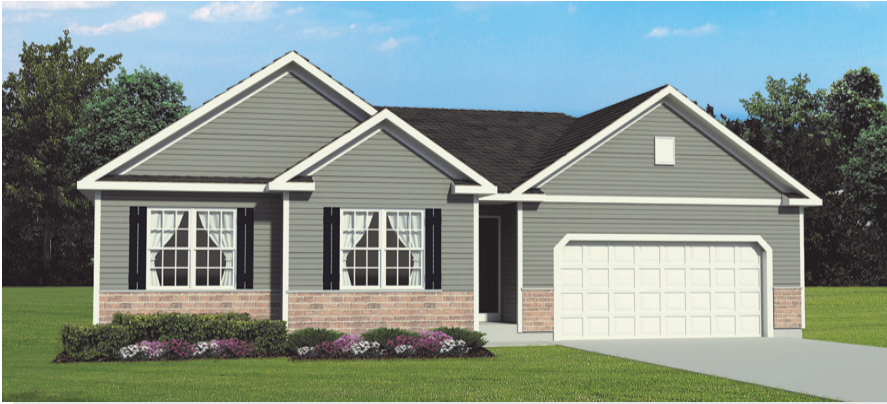
Elevation 1 with optional brick