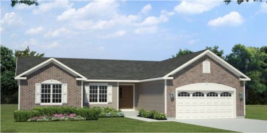
Elevation 1 with optional brick