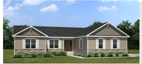
Elevation 2 with optional stone