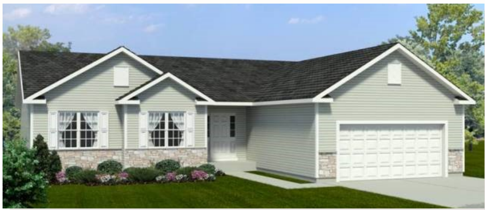
Elevation 1 with optional stone