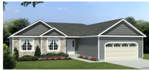
Elevation 2 with optional stone