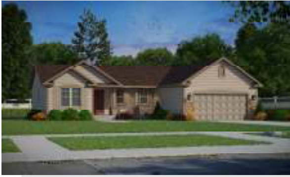
Elevation 1 with optional stone