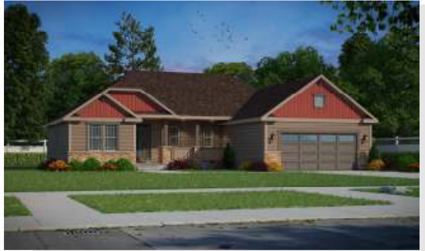
Elevation 2 with optional stone