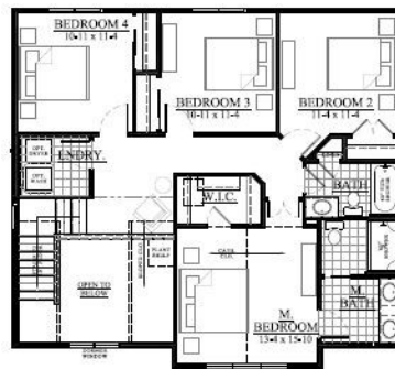
SECOND FLOOR LAYOUT