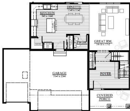
FIRST FLOOR LAYOUT