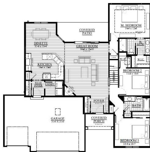
FIRST FLOOR LAYOUT