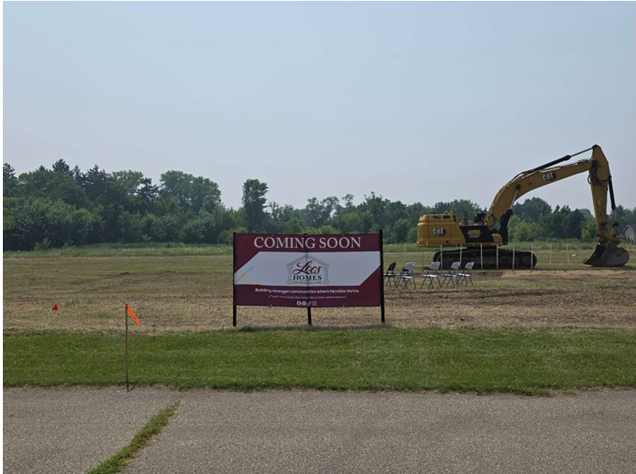
The future site of Pleasant Park in Johnson Creek, Wisconsin.