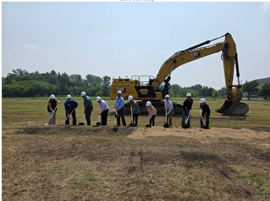
Loos Homes leadership and local government participate in the ceremonial groundbreaking for Pleasant Park in Johnson Creek, Wisconsin, on July 31, 2025.