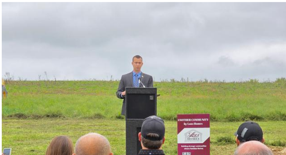
State Representative William Penterman delivers remarks at the Edge Field Groundbreaking Ceremony on September 24, 2025.