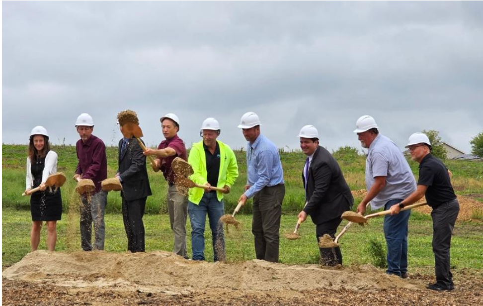
Loos Homes leadership and local dignitaries take part in the ceremonial groundbreaking for Edge Field in Watertown, Wisconsin, on September 25, 2025.