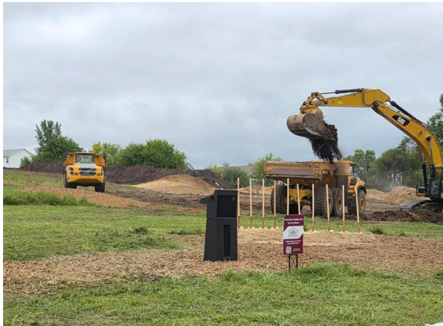
The future site of Edge Field in Watertown, Wisconsin.