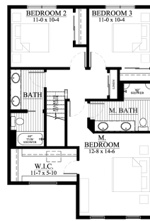
SECOND FLOOR LAYOUT