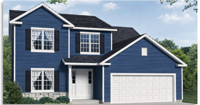
Elevation 2 with optional stone