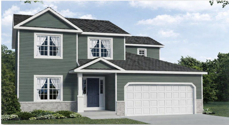
Elevation 1 with optional brick