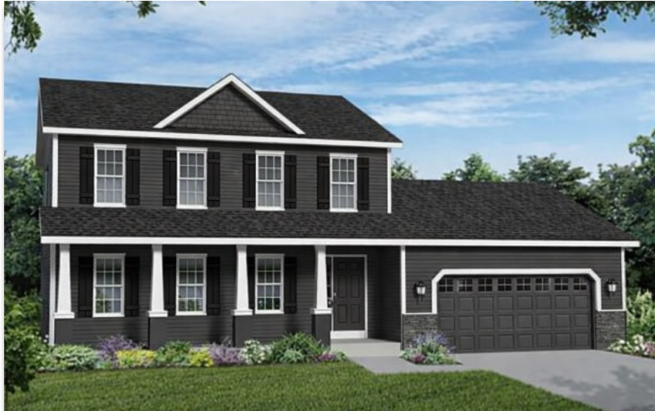
Elevation 1 with optional stone