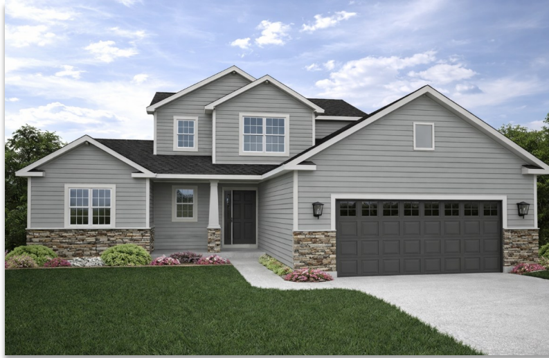
Elevation 1 with optional stone