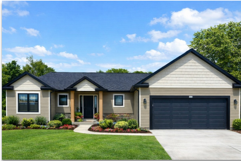
Elevation 1 with optional stone and shake