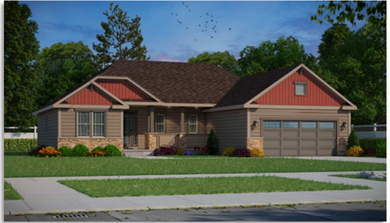
Elevation 2 with optional stone