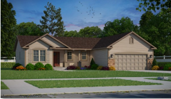
Elevation 1 with optional stone