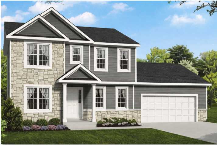
Elevation 1 with optional stone