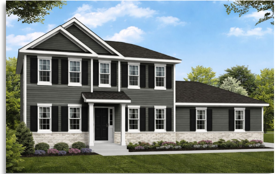
Elevation 2 with optional brick