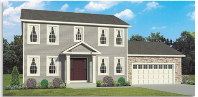
Elevation 2 with optional stone