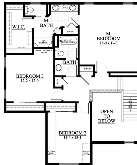
SECOND FLOOR LAYOUT