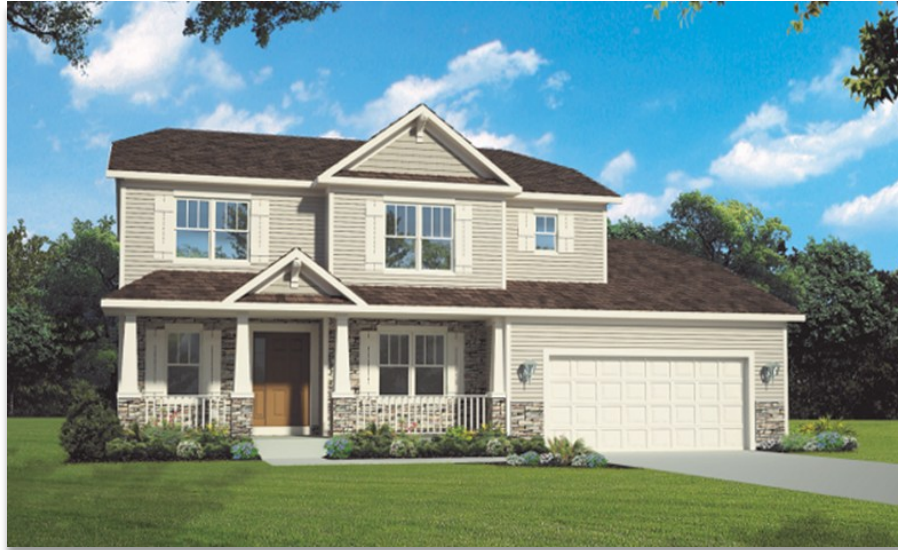
Elevation 1 with optional stone