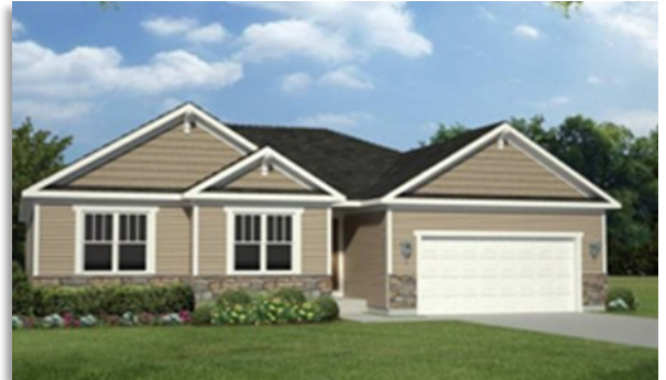
Elevation 2 with optional brick