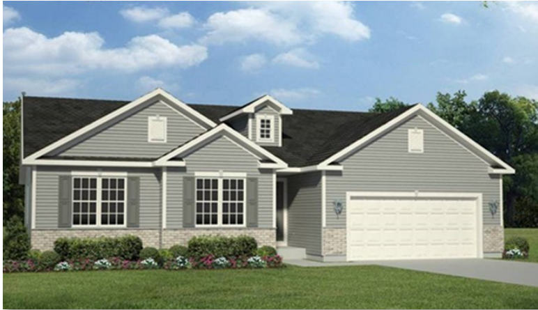
Elevation 1 with optional stone