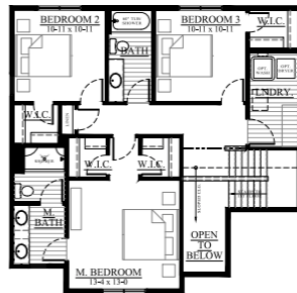
SECOND FLOOR LAYOUT