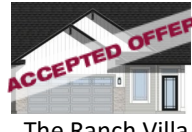
The Ranch Villa