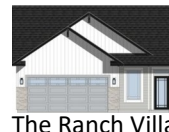
The Ranch Villa

$399,900 2,005 SF Bedrooms: 3 Bathrooms: 3 AUGUST