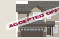
2-Story Town Home